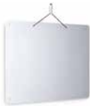
Projection metal screen (21.7 x 17.7 inch with non-glare finish)