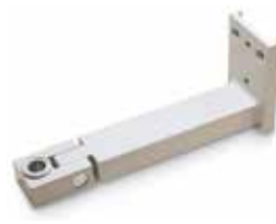
Wall mount bracket